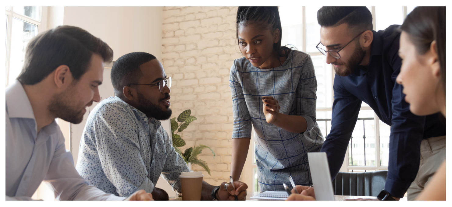
Contact your dedicated Lifetime Benefit Solutions Sales Executive today. LifetimeBenefitSolutions.com